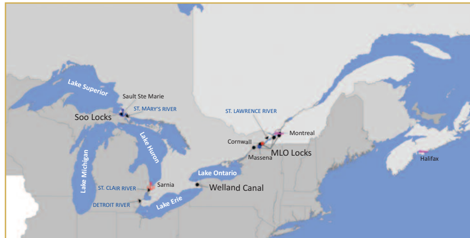
Figure ES1. Great Lakes-St. Lawrence Seaway System

The resulting navigation system — the longest inland, deep-draft marine highway in the world — supports the activities of more than 100 ports and commercial docks. American and Canadian domestic ships and international ocean-going vessels carry more than 160 million tons of cargo via the waterway each year. This activity generates $35 billion in business revenues and supports 227,000 jobs in Canada and the U.S. 1