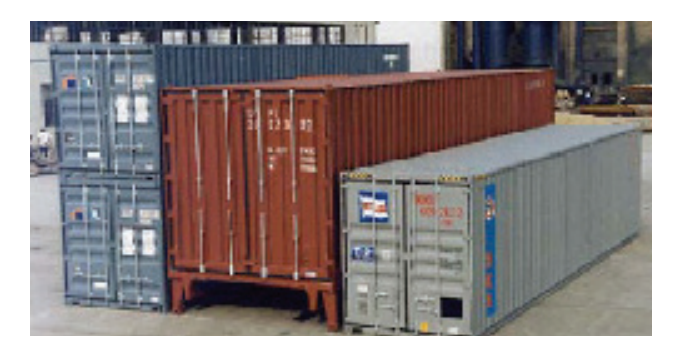
SECU between single and double stacked ISO containers

One of the advantages of marine transportation is its ability to carry heavy cargoes. On some routes marine transportation may provide a viable linkage for freight corridors. Ideally our transportation system would take advantage of each mode's attributes. Industries that produce or consume dense or oversize non-bulk commodities could be clustered near freight corridors that have specially designed highways that overweight trucks can move on bringing the cargo to the marine port for seamless rapid intermodal transfer. The vessel would then link to the next freight corridor. The marine link could move these cargoes between business clusters,