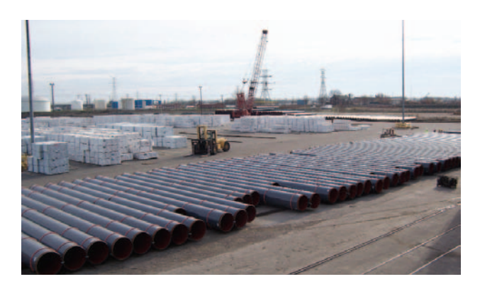
The above pipeline was discharged at Midwest Terminals of Toledo International, Inc. It was manufactured in Germany and shipped from the BLG Logistics terminal in Bremen. The specialized pipeline will be used in the REX project.

In summary, wind turbines and gas-petroleum infrastructure products should provide strong growth for the Seaway this year.