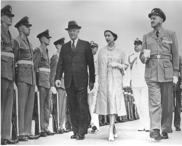
President Eisenhower and HRH Queen Elizabeth II opened the Seaway on June 26, 1959.

About this time sixty years ago, the joint U.S.-Canadian St. Lawrence Seaway navigation project linking the Great Lakes to global markets had just been completed. On April 25, 1959, the icebreaker D'Iberville began the first through transit of the St. Lawrence Seaway, which was officially opened by Queen Elizabeth and President Eisenhower on June 26.