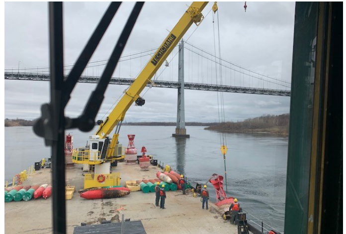
Commissioning LB 14 near the Seaway International Bridge