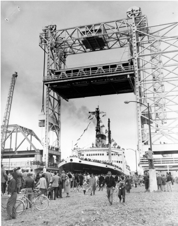
Icebreaker D'Iberville transiting the St. Lambert Lock in 1959.

Over the Seaway's first ten years of operations, certain traffic trends took shape, some unexpectedly. Bulk cargoes represented the largest percentage of Seaway traffic, having a greater share of the traffic than general cargoes, which railroads were moving more competitively. Grain traffic moving on the Seaway saw steady increases over this time, as had been expected, and is the most important product moving on the Seaway.