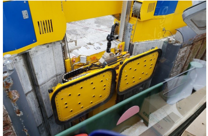
Revolutionary technology: HFM unit from the Upper Control Tower at Eisenhower Lock

Seaway traffic included ship size, transportation policies in both Canada and the United States, the makeup of the fleets plying the Seaway and the Great Lakes, and the slow pace of port improvements to prepare for ocean shipping. Though these commodity trends have not changed dramatically over the course of 60 years, there is much that has changed at the Seaway.