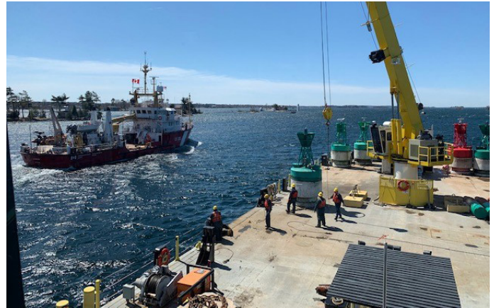
Preparing to commission LB 211 while being overtaken by CCG vessel

These seven permanently fixed aids are not protected by a large mooring cell as most other fixed lights are and are more susceptible to damage from ice flows. The crew will remove these lights in December to protect the integrity of the unit. ■ ■ ■