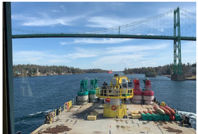
Passing under the 1000 Island Bridge