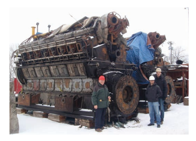
The M/V Edwin Gott's old enterprise engines

In 2010, Great Lakes Maritime Research Institute was awarded a $750,000 U.S. Environmental Protection Agency (EPA) Region 5 Midwest Clean Diesel Initiative