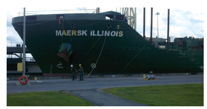
The Maersk Illinois came through the Eisenhower Lock loaded with two 2800XPC rope shovels manufactured by Wisconsinbased P&H Mining Equipment. It will carry the heavy equipment through the locks of the St. Lawrence Seaway and across the Atlantic Ocean to a Siberian coal mine.