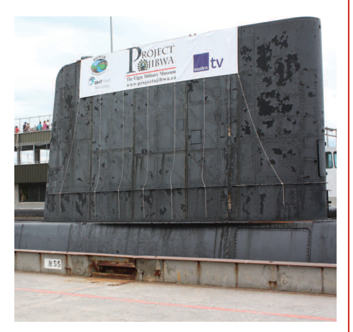
Retired submarine, the HMCS Ojibwa, traveled through Eisenhower Lock on its 12-day journey from Halifax, Nova Scotia to Hamilton, Ontario with assistance from Heddle Marine Services Inc. and McKell Marine Limited. The 300 foot-long, five-story-high submarine will be transported overland to its permanent home. After extensive restoration over the upcoming winter, the Ojibwa will open as a military museum in the summer of 2013.