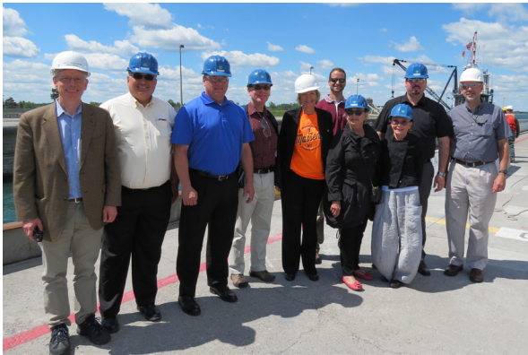
U.S. Great Lakes Port Representatives.

On June 21, 2016, the Saint Lawrence Seaway Development Corporation (SLSDC) offered a first-of-its-kind tour of the U.S. lock infrastructure of the St. Lawrence Seaway in Massena, New York. The tour was attended by U.S. port authorities as well as other economic and trade organizations that are interested in and rely on the successful operation of the binational Great Lakes St. Lawrence Seaway (GLSLS) System. Participating organizations included the Ports of Indiana, the Ogdensburg Bridge and Port Authority, the Detroit/Wayne County Port Authority, the Village of Massena, New York, the Mohawk Council of Akwesasne, and numerous others.