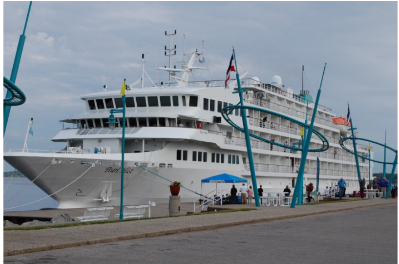
The Pearl Mist docked at the Port of Muskegon.

The VICTORY I departed the Great Lakes at the end of the 2015 season acquiring a new name, owner/operator and had several upgrades to both the interior and exterior of the ship. The new operator of Victory Cruise Lines is based in Miami, plans to cruise the Great Lakes between June and early October, and has developed itineraries for three to 11 day cruises. The vessel will visit the Canadian ports of Toronto, Little Current, Perry Sound and Sault Ste. Marie, Port Colborne and Port Weller, Ontario and