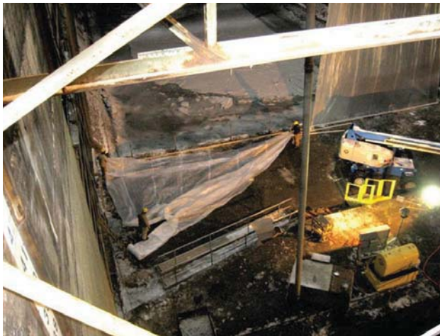
Crews hang plastic curtains to isolate the work area.

Maintenance crews have already dewatered, inspected and made repairs to lock structures and machinery at Eisenhower Lock which are inaccessible during the navigation season. Repairs were made to cracks in the downstream miter gate, and shims were installed on the upstream miter gate to compensate for wear on the miter contact blocks. Snell Lock has been covered and dewatered and heaters have been installed and the work areas set up. In the first photo, you can see crews hanging plastic curtains to isolate a work area to conserve