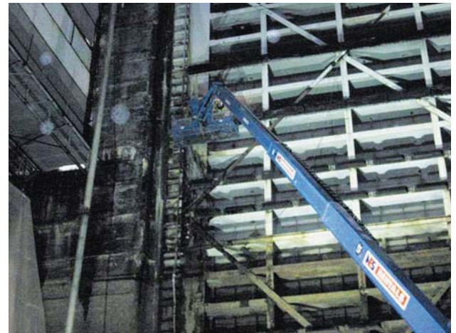
Crews being lifted to replace damaged rubber fenders on the downstream miter gate.

heat and energy. Work has commenced for replacing damaged rubber fenders on the downstream miter gate at Snell Lock. This work is being done from a personnel lift as can be seen in the second photo. Crews have begun removing a filling valve at Snell Lock for reinforcing and painting and inspections of the culvert valve operating machinery open gearing at both locks are almost complete. All projects are on schedule for completion in early to mid-March.