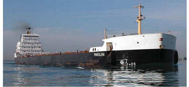
The Canadian M/V PINEGLEN, closed the St. Lawrence Seaway 2007 Navigation Season.

The Canadian M/V PINEGLEN loaded with 15,692.5 tons of pig iron (refined ore) bound for Marinette, Wisconsin, cleared the U.S. Seaway locks on December 28. This ship officially closed the Montreal-Lake Ontario section of the St. Lawrence Seaway ending the binational waterway's 48 th navigation season at 283 days.