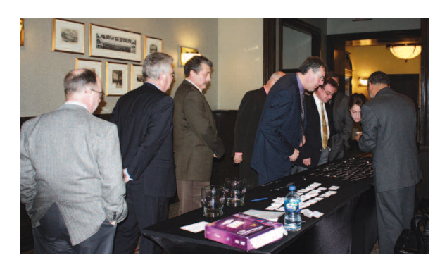
Stakeholders eagerly wait in line to attend the 2009 SLSDC Stakeholder Appreciation Reception.

In honor of Great Lakes St. Lawrence Seaway System Stakeholders, the Saint Lawrence Seaway Development Corporation and the St. Lawrence Seaway Management Corporation co-hosted their annual reception during Grunt Club week in Montreal, Canada on December 3, 2009 at the InterContinental Montreal Hotel. Both corporations were very pleased that more than 150 stakeholders from throughout the Seaway System attended the event.