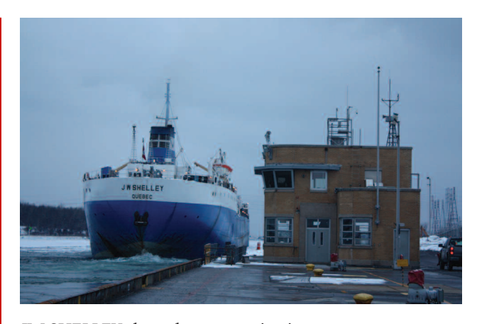
JW SHELLEY closes the 2009 navigation season.

The 750-foot, Canadian-registered vessel JW SHELLEY completed its transit of the U.S. Seaway Locks in Massena, N.Y., on December 28 at 4:54 p.m., and cleared the Montreal-Lake Ontario section of the binational waterway at 7:56 a.m. on December 29. The vessel entered the waterway destined for Hamilton, Ontario, in ballast. The Montreal-Lake Ontario section of St. Lawrence Seaway officially closed December 29, ending the binational waterway's 51st navigation season at 274 days.