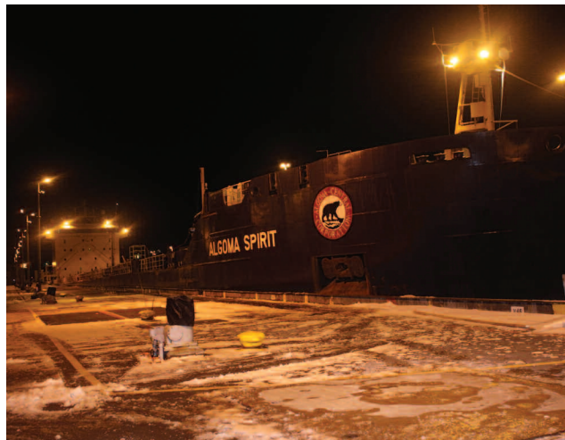
M/V Algoma Spirit cleared Eisenhower Lock in Massena, NY at 11:10 p.m. ending the 2011 navigation season.

The St. Lawrence Seaway's positive momentum remained intact in 2011, with tonnage volumes rising by 2.5% to reach an estimated 37.5 million tons. Trade patterns exhibited a number of changes, most notably with iron ore and coal becoming export commodities due to strong overseas demand. Grain volumes decreased overall by some 64% due to a decrease in the amount of U.S. grain moving via the Seaway. Strong increases in the volume of bulk liquids, salt and metal contributed to an overall cargo increase of 930,000 tones for the System's 2011 season.