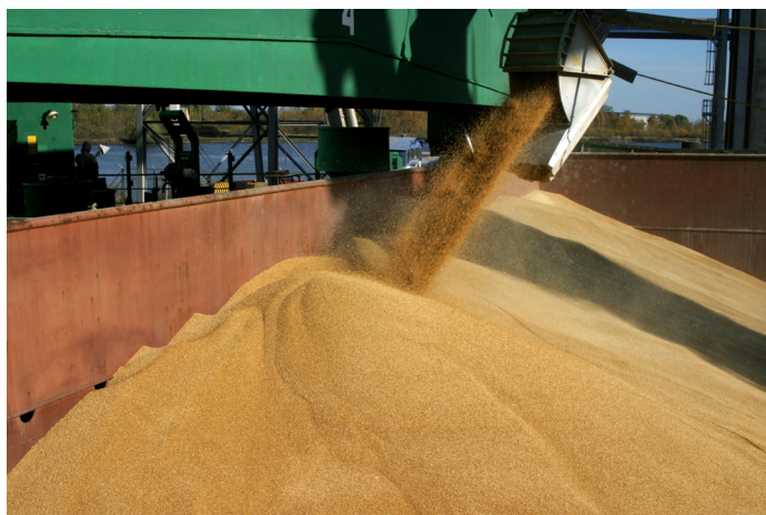
The movement of Canadian grain out of the Great Lakes St. Lawrence Seaway System has started off strong with plenty of inventory from the Fall 2022 harvest.

The past three navigation seasons exemplify how different cargo sectors can see those shifts in their Seaway traffic. 2020, as we know, had previously unseen supply chain impacts in so many ways with many sectors literally shutting down. Yet, despite that, there were sectors that maintained steady traffic flows. Two of those sectors were export grain shipments, which increased year over year, and wind energy cargo which was incredibly strong systemwide including a record-setting season at the Port of Duluth-Superior.