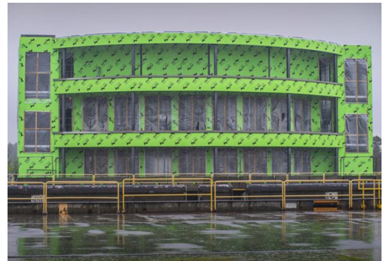
Construction of the new Seaway Visitor Center is progressing on schedule, and the facility is expected to open in spring, 2024.

The construction of the new Seaway Visitor Center is on track for completion towards the end of 2023, with plans to open its doors in the spring of 2024. ■ ■ ■