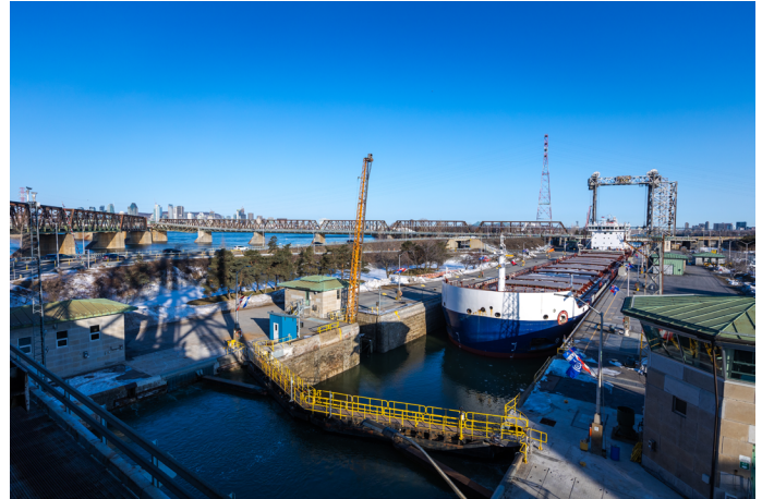
The 740' Capt. Henry Jackman, a Seawaymax Equinox Bulk Carrier built in 2021, was the first ship to transit through the lock at St. Lambert on Wednesday, March 22, 2023, marking the start of the 65th navigation season of the St. Lawrence Seaway.