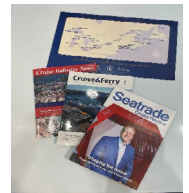
A robust public relations campaign to raise awareness of the Great Lakes as a cruising destination was secured through placements in key trade publications.