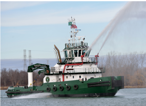
Seaway Guardian tug with hoses.

On December 18, 2022, as the Seaway Guardian made her debut buoy run pushing the Buoy Barge upriver to commence the 2022 decommissioning of US Aids-to-Navigation in the Seaway, she suffered a port main engine shut down due to a mechanical failure.