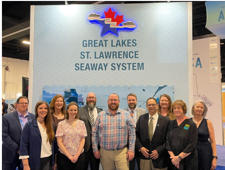
Great Lakes St. Lawrence Seaway System delegation at the 2023 Seatrade Cruise Global conference in Fort Lauderdale, Fla.

Seatrade Cruise Global continues to be the leading business-to-business event where exhibitors from around the world can discuss their product directly with cruise lines representatives.